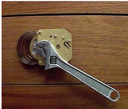
Figure 2. Wind clock 5 or 6 times counter clockwise

Instructions for winding replacement clocks – 12 and hour 24 hour