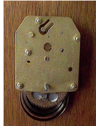
Figure 3. Shows clock with spring wound. Clock is ready to be mounted to the feeder.

Instructions for winding replacement clocks – 12 and hour 24 hour