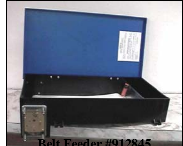
Belt Feeder #912845

There are two sizes available, the Baby Belt Feeder has a 5 pound capacity and the Belt Feeder has a 10 pound capacity. Each unit is available with a 12-hour or 24-hour clock.